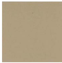
1070 Sandy Buff