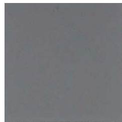
600 Light Gray