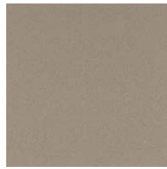
1090 Sun Buff